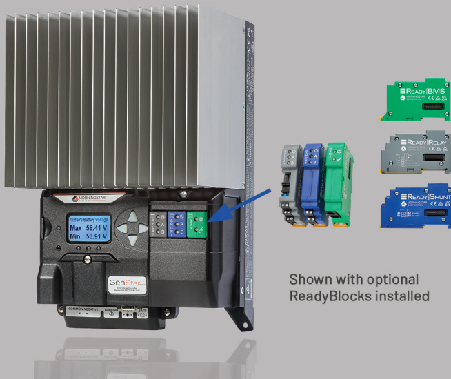
Shown with optional ReadyBlocks installed