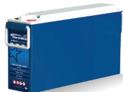
NSB 155FT BLUE+