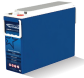
NSB 92FT BLUE+