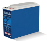
NSB 40FT BLUE+