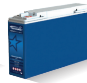
NSB 210FT BLUE+