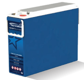
NSB 100FT BLUE+