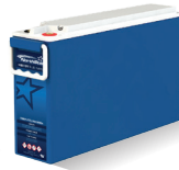
NSB 170FT BLUE+